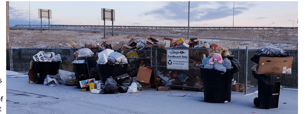
Lots of non-recyclable items are being left at the Sturgis Recycling Center.

"I don't want to lose recycling and so I guess